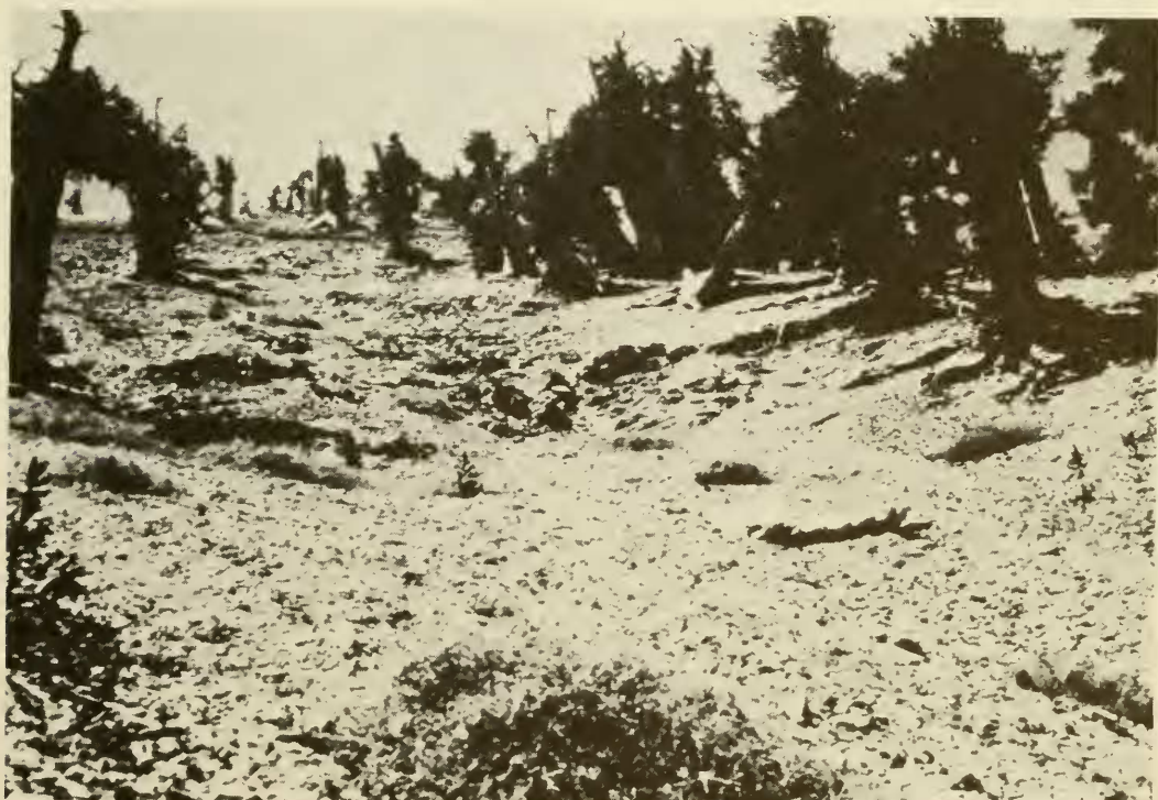
Fig. 4. Ecotone between Alpine and Coniferous Forest biomes. Open stand of bristlecone pines. Clark County, Charleston Peak, Spring Mountains.

Table 1 shows that our montane ants are a relatively unspecialized lot. Myrmica comes first on everybody's list of Myrmicinae and Manica is second. Stenammina and Aphaenogaster are not far above them. But